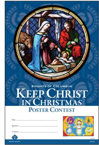
Keep Christ in Christmas Poster Contest Poster (#5026)