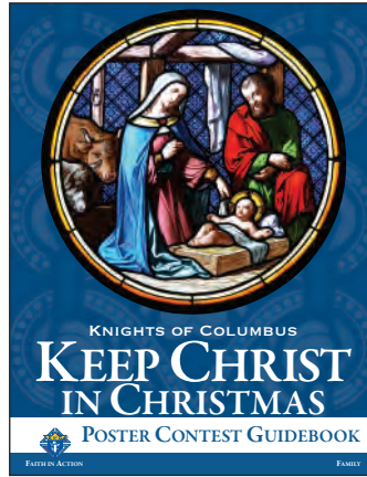
Keep Christ in Christmas Poster Contest Guidebook (#5024)